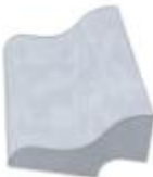
Cella Energy tank