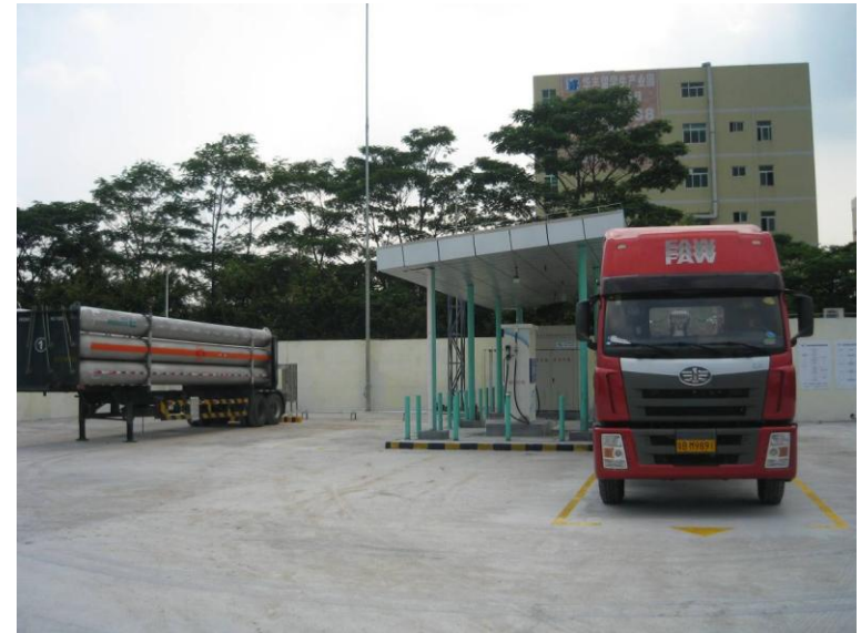
Hydrogen Station in Shenzhen