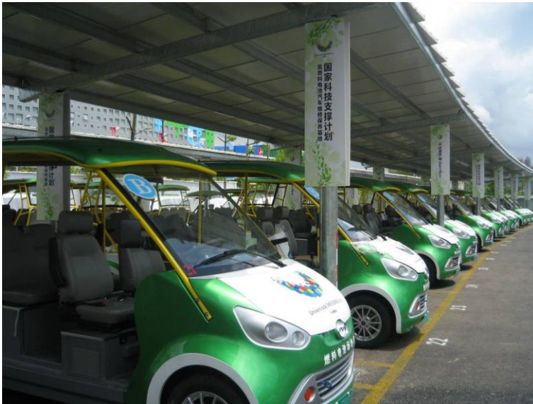
The fleet of FC Sight-seeing Cars